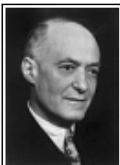
Sir C. Hinshelwood

Sir Cyril Norman Hinshelwood, O.M., M.A., D.Sc., F.R.S., Nobel Prize in Chemistry , 1956 University of Oxford