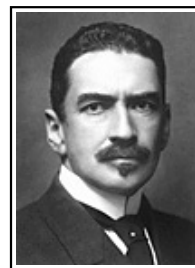
H. von Euler-Chelpin