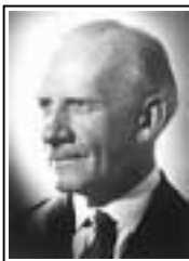
Sir R. Robinson

Professor Arturi I. Virtanen, Nobel Prize in Chemistry 1945 Director, Biochemical Institute, Helsinki; president, Finnish State Academy of Sciences and Art.